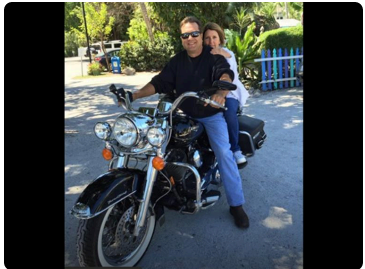
A fun ride to Captiva