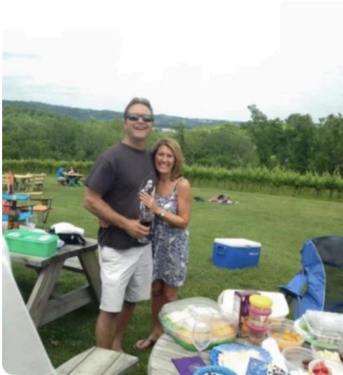
Moondancer Winery in York, PA