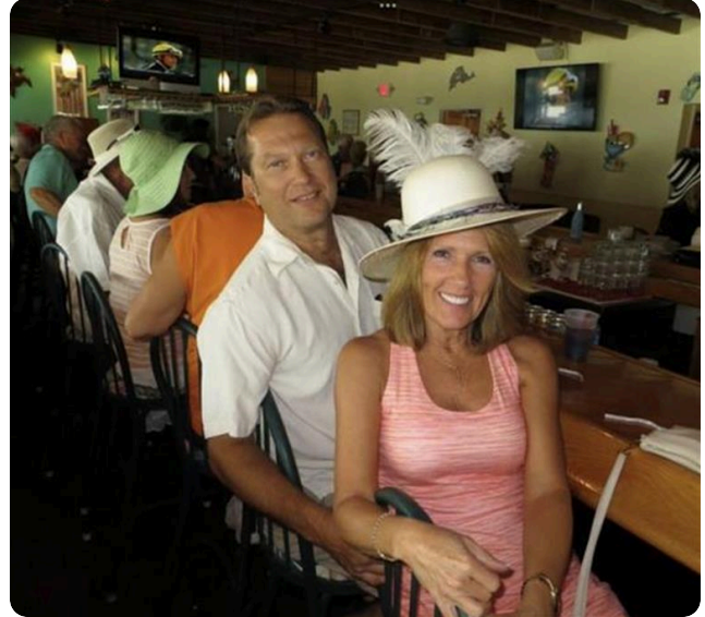
A fun night at The Cottage on Ft Myers Beach